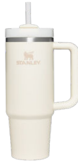
1603-02 Stanley Quencher H2.O FlowState™ Tumbler 30 oz