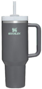
1603-01 Stanley Quencher H2.O FlowState™ Tumbler 40 oz