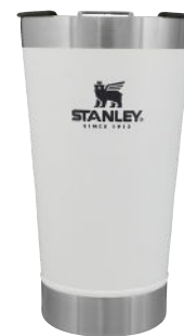
1603-06 Stanley Stay-Chill Beer Pint 16 oz