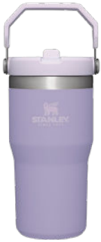
1603-04 Stanley IceFlow™ Flip Straw Tumbler 20 oz