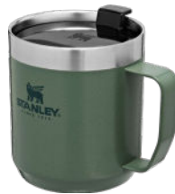
1603-11 Stanley Legendary Camp Mug 12 oz