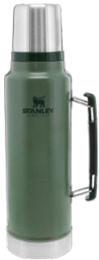
1603-14 Stanley Legendary Classic Bottle 48 oz