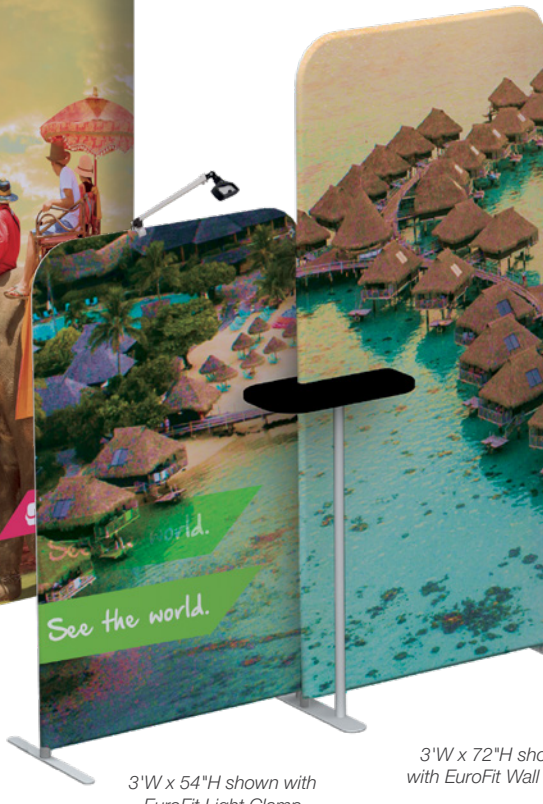
3'W x 54"H shown with EuroFit Light Clamp