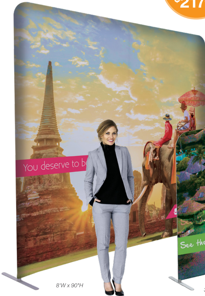
8'W x 90"H