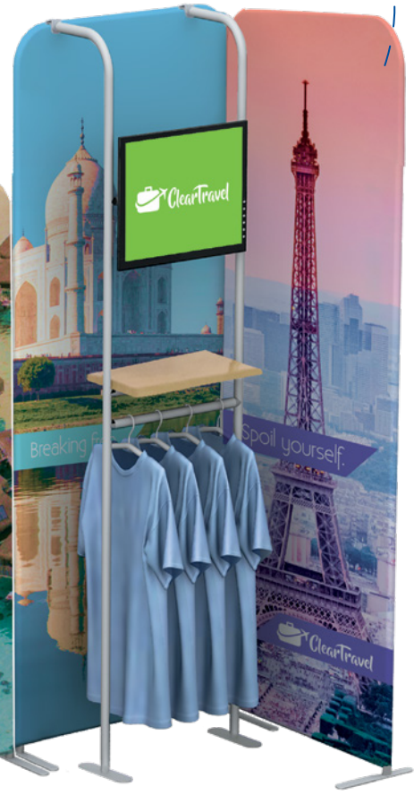
3'W x 90"H shown with EuroFit Cascade Hanger Merchandiser